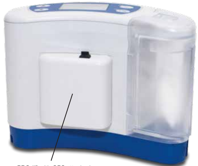
PRO-II ® with GPS attached