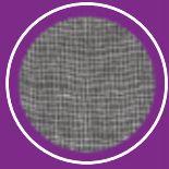
Grade 20 Weave