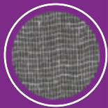
Grade 10 Weave