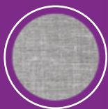
Grade 90 Weave