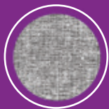
Grade 60 Weave